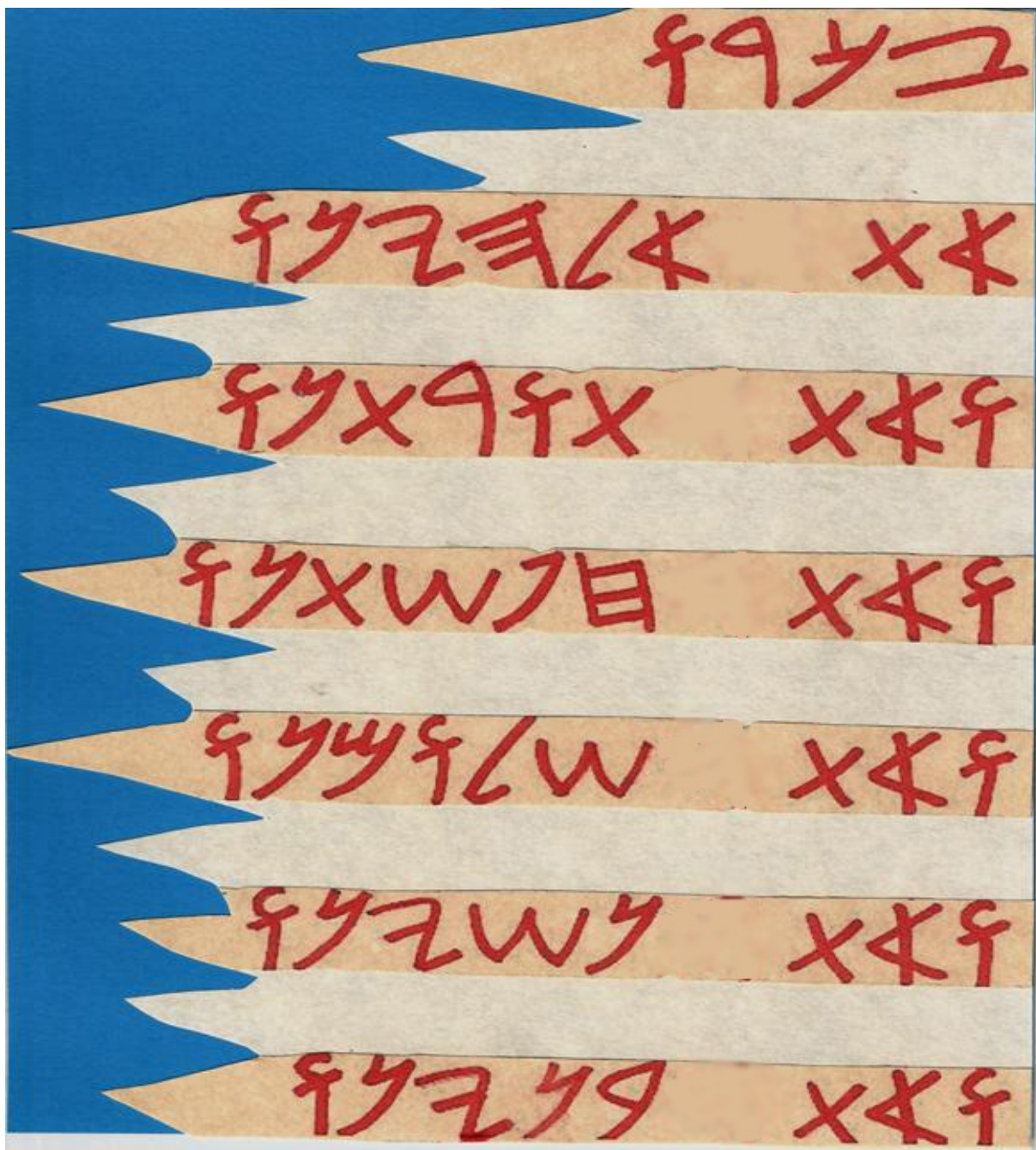
America's Ancient Banner of Liberty (Alma 46:12-28)

“And it came to pass that when he had poured out his soul to God, he named all the land which was south of the land Desolation, yea, and in fine, all the land, both on the north and on the south—A chosen land, and the land of liberty.” (Alma 46:17)